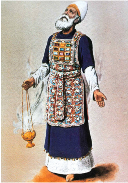
High Priest in OT

Psalms 110:4 (MESSIANIC PROPHECY) The LORD has sworn and will not change His mind, "You (MESSIAH) are a priest forever According to the order of Melchizedek."